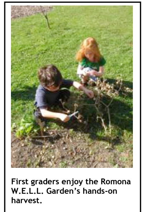
First graders enjoy the Romona W.E.L.L. Garden's hands-on harvest.

Since 1993, the Foundation has awarded over 200 Gripp Grants funding innovative educational programs, experiences, and technologies that expand, enrich, and complement the D39 schools' curricula. In 2008-09, 13 new Gripp Grants were funded, supporting initiatives for students from kindergarten through 8 th grade, and across all six D39 schools as well as the broader community. New software and technology trials, whole-body fitness equipment, photography equipment, and programs aimed at teens and 'tweens were among the new grants.